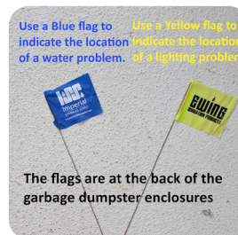
The flags are at the back of the garbage dumpster enclosures